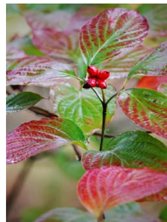
Dogwood in Fall by Jane Strobach on display in the Longwood Gardens Conservatory Gallery September 7— October 31