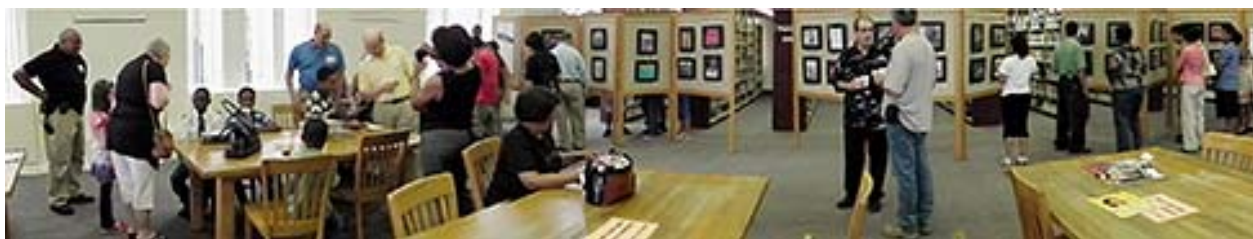
Youth-in-Focus Opening Reception, Wilmington Public Library

Karl Leck used the panoramic function of the Fujifilm HS10 camera to photograph the event.