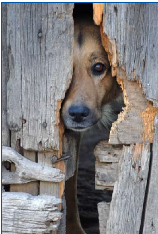
"Seeing Eye Dog" earned a PSA Gold and Silver medal and four Honorable Mentions in the Travel Photo Theme section "The Door" at NORGA.

Acceptances in these exhibitions count towards PSA Stars. Each PSA division awards their own stars, but the number of acceptances required is the same for each division. For example, for the first star one needs 18 acceptances with six different titles (images), for the second 36 acceptances with 12 titles, for the third 72 acceptances with 24 titles, and so on.