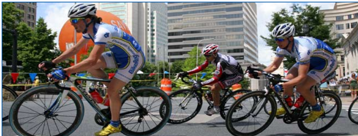
May 2011 Fieldtrip, Wilmington Grand Prix