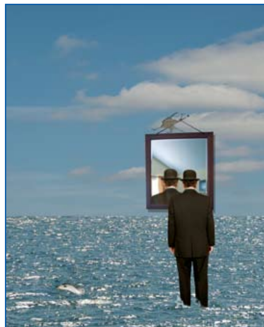
Hey Marvin, who's the fairest of them all!

A slide show of the winning photographs can be seen at: http://psa-photo.org/divisions/cpid/creative-interclub/2010-11-bob/