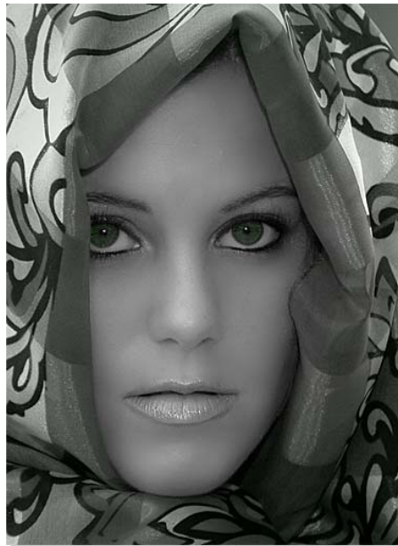
Green Eyes