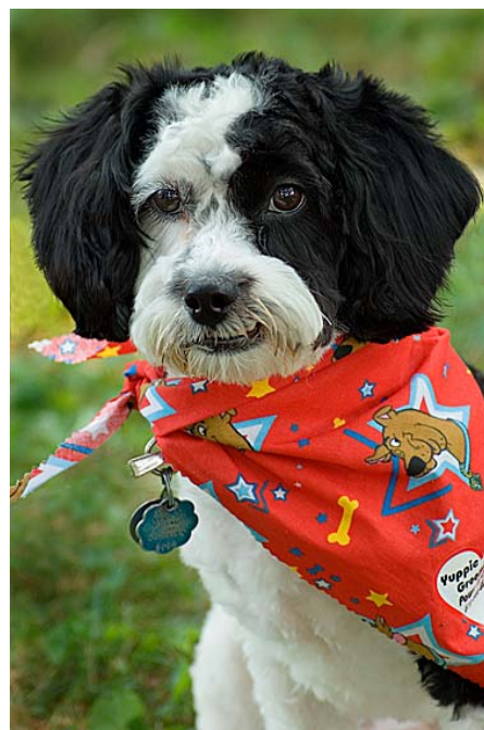
Yuppie Puppy

• Closing date for the 5 th Holland International Slide Circuit 2006 is November 25, 2005. You may download the entry form at: http://www.hollandcircuit.nl