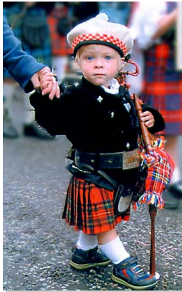
Posing in Scottish Finery

In our "off-duty" hours, there was time for photo opportunities.