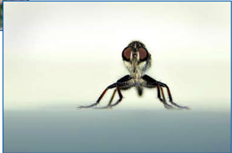
"Bug On Dash" by FRANK DIPIETRAPAUL Salon High Score